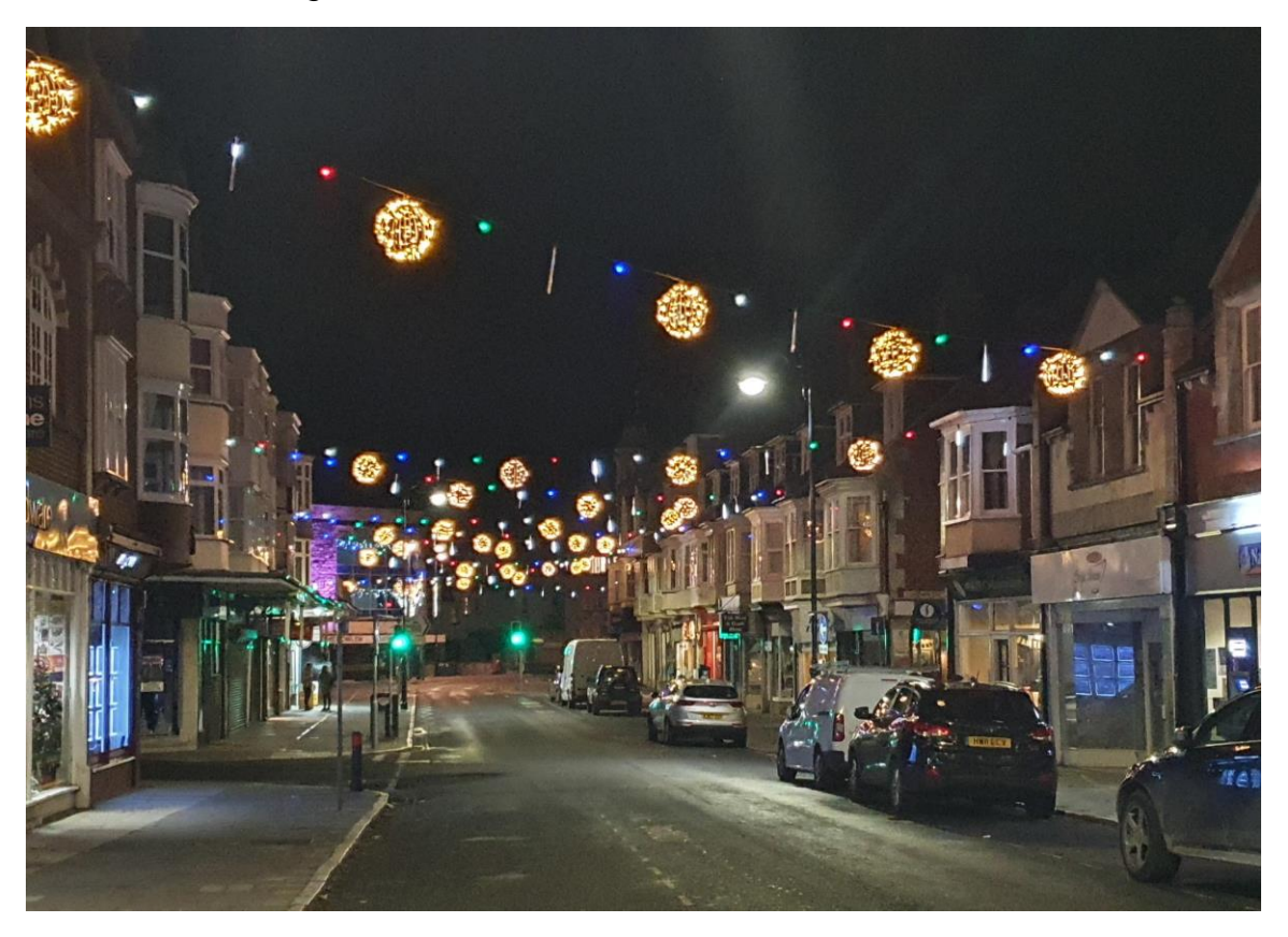
'Sphere' close up